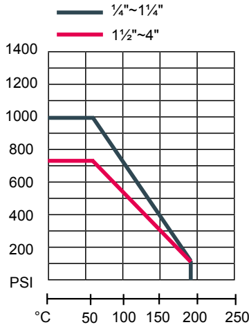
Pressure Temperature Compare